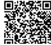
Scan QR for Bus Stop Map & Schedules

Yuma Education Consortium (YESD1 & YUHSD Transportation) – (928) 502-8840